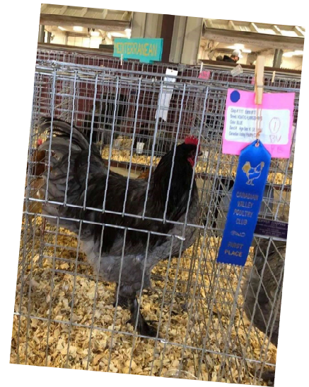
BV & RB Blue Cockerel