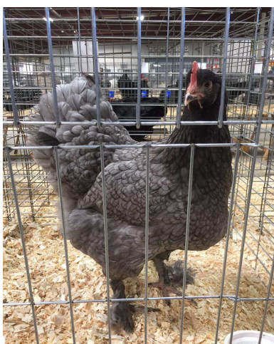
Todd Sensenig RB LF Blue Pullet