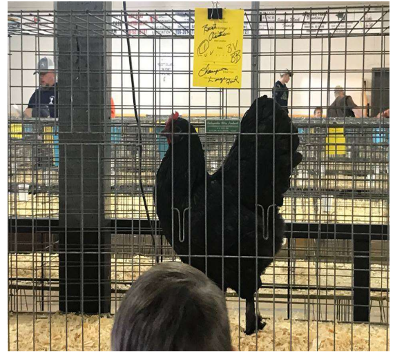
North East Georgia Poultry Fanciers