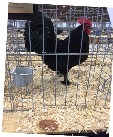
Todd Sensenig RB Black Bant Delmarva