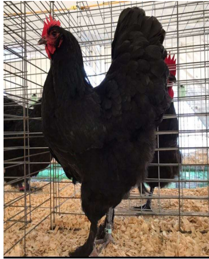
Chattahoochee Valley Poultry Fanciers