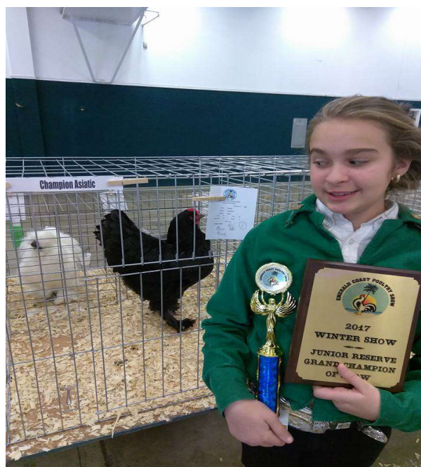
Sage Lonergan Best of Breed Large Fowl