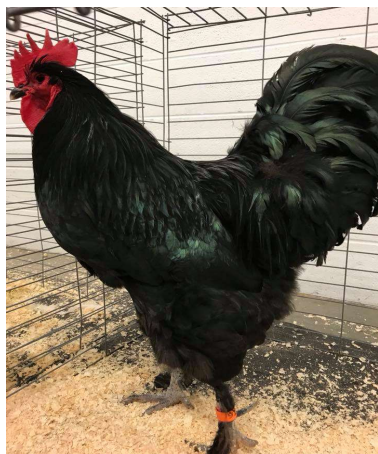
Tim Ballenger RB Black Cock Delmarva