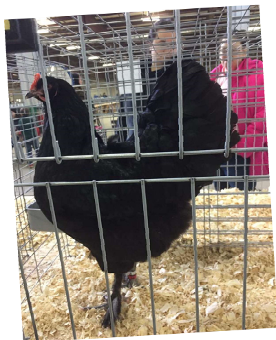
Brittany Shippee BB LF Black Pullet