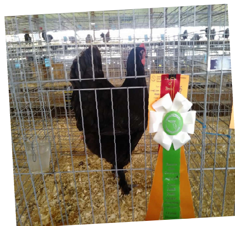
Kelsey Orlando RB Black LF Junior Show