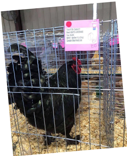
BB Black Cockerel