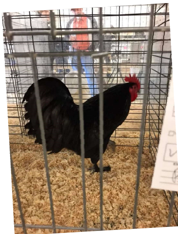
Tim Ballenger BB Black Bant. Delmarva