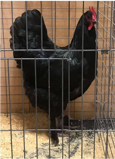
Peach State Poultry Fanciers Rev