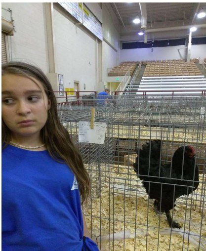
Sage L wins BB LF Langshan At Central Heritage Poultry Classic