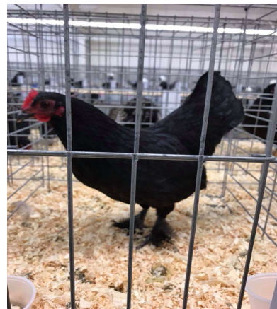
Todd Sensenig RB Black Bant Delmarva