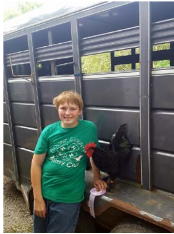
Duncan Curts BB Cockerel