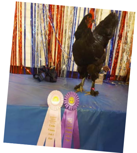
Lane Atchley- Resv Champion of Show