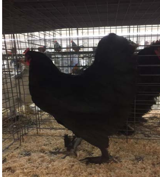
Michelle Klaes- RV Black Pullet LF Delmarva