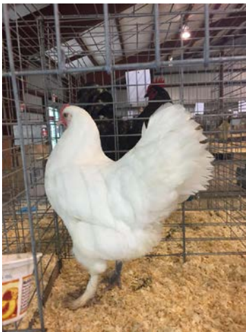
Todd Sensenig White Pullet RV